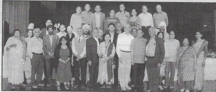
Donors and prominent Jain and Sikh community leaders at the event