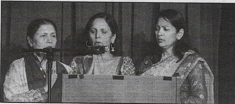
The ceremony opened with a prayer