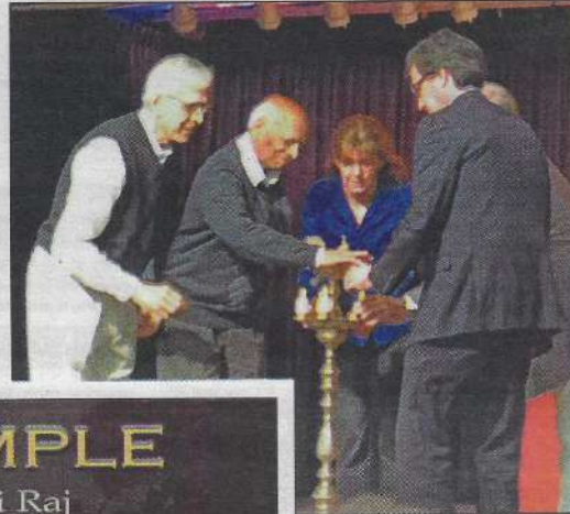
The lamp lighting ceremony